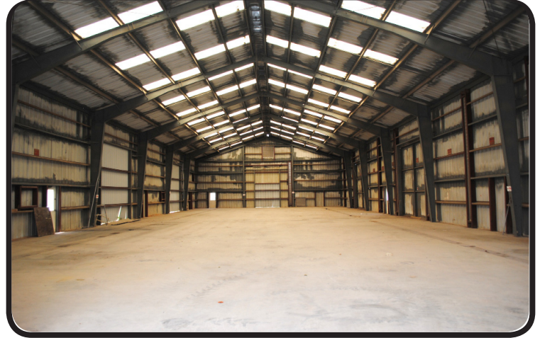
Building 1027. Building 1027 is 10,500 SF/975 m2 and is clear span with eave height of 20 feet/6 meters. Located in a cluster of similar buildings with a total square footage of approximately 45,000 SF/4,181 m2.