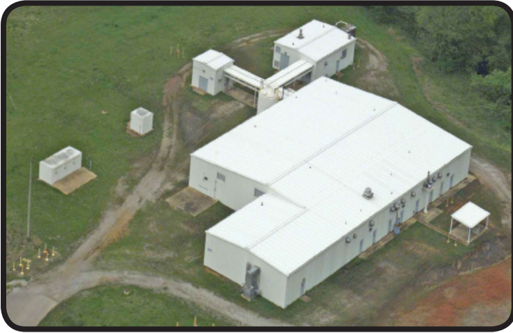
Laboratory. 16,100 SF/1,496 m2 in three buildings. Former NASA chemical laboratory, fully equipped with testing equipment. 10' ceiling clearance. Nitrogen and carbon dioxide gas systems.