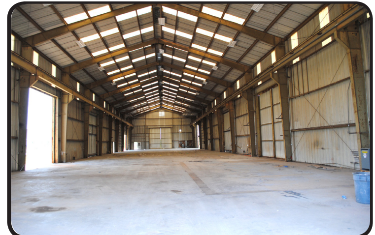
Building 1020. Building 1020 is 15,000 SF/1,394 m2, has a ten ton bridge crane, and is clear span with eave height of 20 feet/6meters. Two similar buildings are located adjacent to Building 1020.