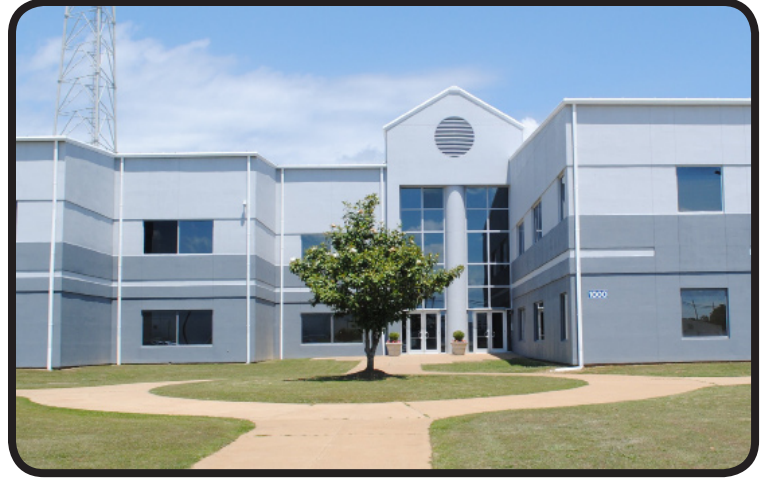
Office Complex. 169,000 SF/15,700 m2 office complex with approximately 100,000 SF available, fully furnished. 400 cubicles and 80 offices, conference center, break-rooms, computer room, community college, & cafeteria.