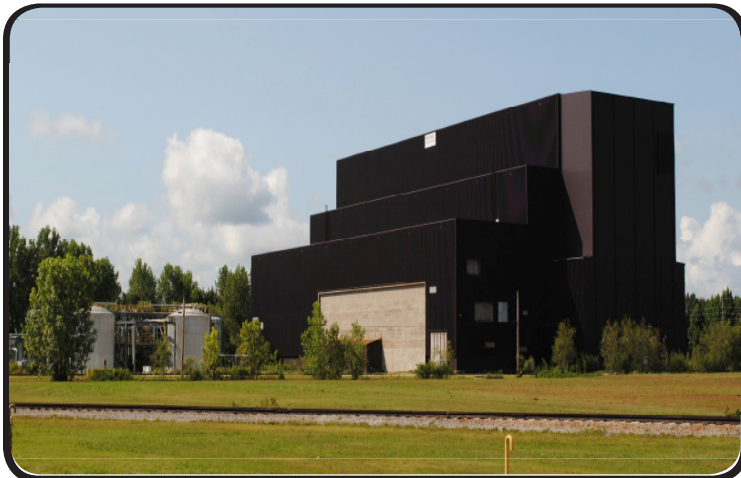
Turbine Building. The turbine building is 66,528 SF/6,181 m2, has a 250 ton crane, and an eave height up to 90 feet/27 m. The building has rail into the building.