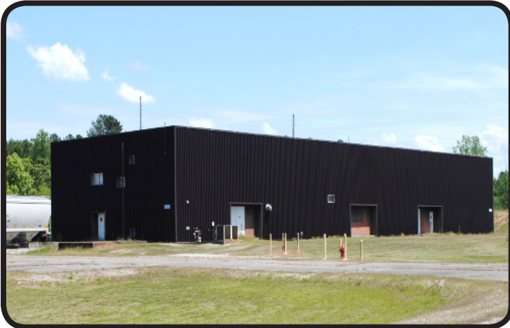
Remote Control Building. 11,200 SF/1,448 m2 remote control building. Rail adjacent to building. Computer control room, offices, and observation deck. Large base-ment.